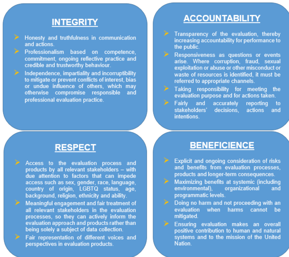
Figure 1: UNEG Ethical Guidelines for Evaluation (2020)