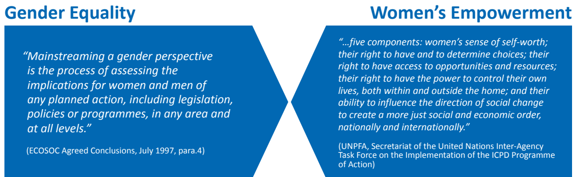
Figure 1. Gender Equality and Women’s Empowerment