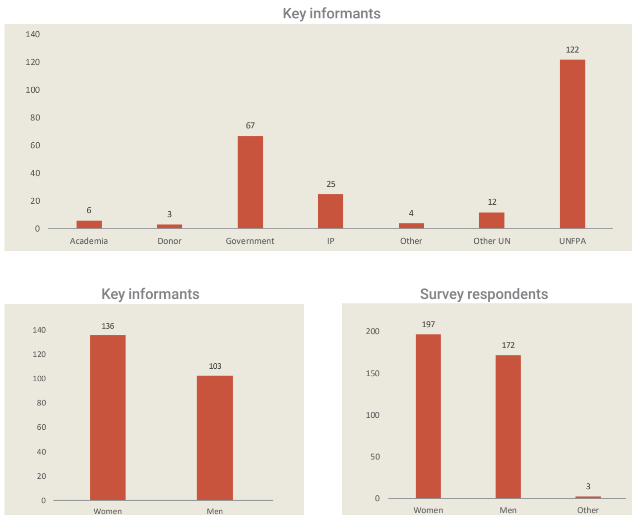
FIGURE 6: Overview of data sources

The evaluation interviewed 239 key informants; 136 were women and 103 were men. Out of these key informants, 122 were internal to UNFPA and the others external, across academia, donors, governments, implementing partners, and other United Nations agencies. A total of 217 documents were reviewed. Furthermore, 372 UNFPA staff responded to the survey. Annexes III and IV present a list of key informants and a bibliography, respectively.