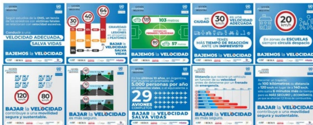
Figure 1 Infographics created for the project